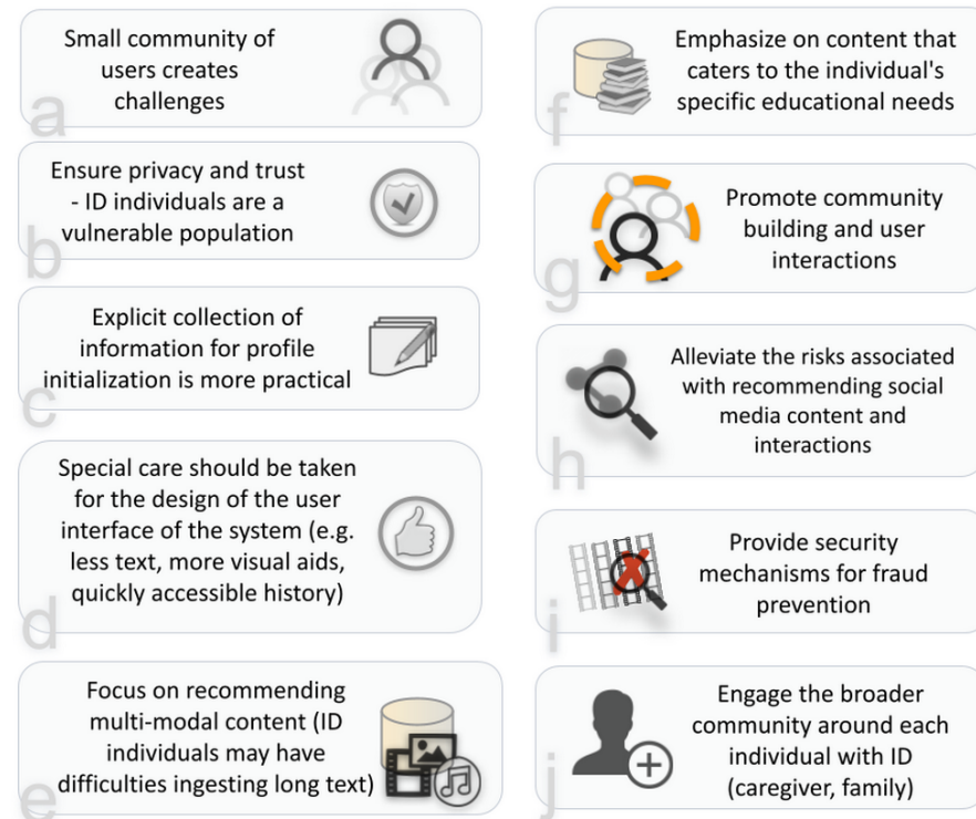
Figure 3. Infographic of the specific features that a content recommendation system targeted to individuals with ID must pay attention to.

cally designed for this population. To this end, we also rely on the review of the relevant literature presented in Sections 2 and 4. The specific desirable characteristics of such a content recommendation system are summarized in Figure 3; below, we elaborate on each of them.