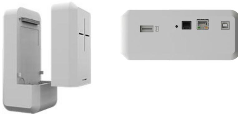
Figure 2. The ECOMZEN sensor station.