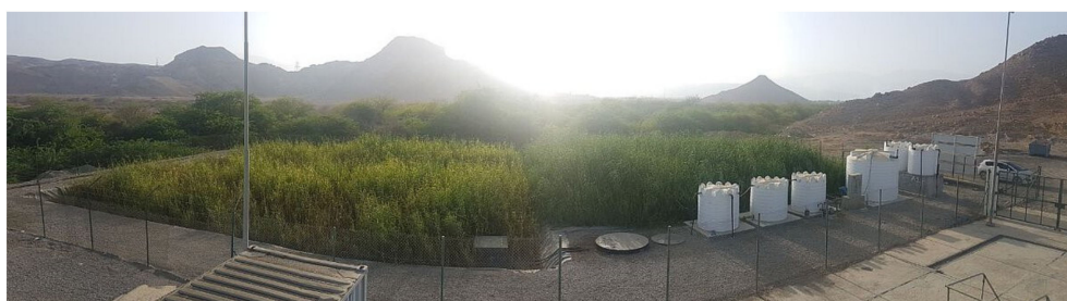
Figure 3. Aerial view of the pilot French Vertical Flow Constructed Wetland in Quriyat, Oman consisting of two stages with VF beds and effluent recirculation ([53]; Courtesy of Haya Water).

A similar pilot VFCW was built in 2017 for research purposes by Haya Water (the governmental wastewater management company in Oman) at the wastewater treatment plant of Quriyat town (Figure 3). This pilot facility has a capacity of 25 \text{ m}^3/\text{day} , and a total wetland area of 1040 \text{ m}^2 [53]. This pilot wetland is the typical two-stage French system modified with effluent recirculation to further enhance the performance in terms of denitrification according to the stricter Standard A (Oman Ministerial decision 145–1993), i.e., \text{BOD}_5 < 15 \text{ mg/L} , \text{COD} < 150 \text{ mg/L} , \text{NH}_4\text{-N} < 5 \text{ mg/L} , \text{TP} < 30 \text{ mg/L} , \text{EC} < 1500 \mu\text{S/cm} , \text{TSS} < 15 \text{ mg/L} .