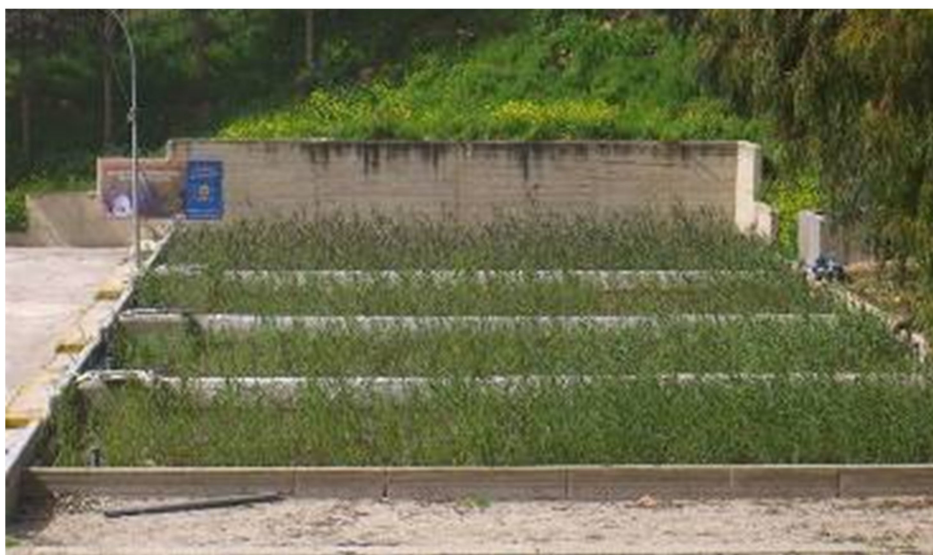
Figure 8. The pilot Sludge Treatment Wetland beds at the Al-Salt wastewater treatment plant in Jordan [74].

One of the first Sludge Treatment Wetlands (STW) in the Middle East was a pilot system built at the Al-Salt wastewater treatment plant in Jordan between 2011–2013, as part of the ACC (Adaptation to Climate Change) project “Decentralized Wastewater Management for Adaptation to Climate Change in Jordan” commissioned by the German Federal Ministry for Economic Cooperation and Development (BMZ) in partnership with the Ministry of Water and Irrigation of Jordan and the University of Jordan [73]. Four previously unplanted drying beds of 160 m 2 area each were modified to STW beds receiving 8–10 m 3 of sludge from the conventional wastewater treatment plant [74] (Figure 8). After this demonstration phase, a STW system is currently under construction at Wadi Hassan in Jordan (Ingenieurbüro Blumberg, Bovenden, Germany) to treat 50 m 3 /day of sludge with 3% dry solids content from an extended aeration wastewater treatment plant. The sludge loading rate selected is 70 kg ds/m 2 /year and the area of the STW facility is approximately 4000 m 2 .