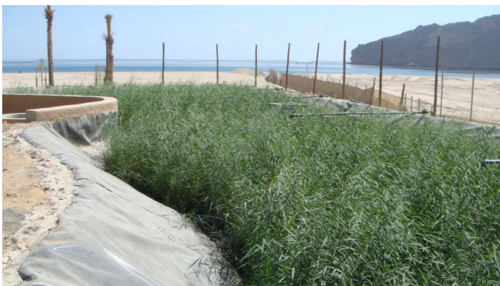
Figure 9. The Sludge Treatment Wetland at the Six Senses Resort in Zighy Bay, Dibba, Oman ([52]).

Another 2–3 STW facilities also exist in Bahrain, in UAE and in Qatar, however, with limited available information on their status [74]. In general, the use of CWs for sludge dewatering and drying in the region is extremely limited. However, the hot climate of the Middle East creates conditions favorable for the development of these systems, allowing for higher sludge loading rates to be applied due to higher ET rates and efficient airdrying, as also indicated by pilot STW units tested under a similar climate in Australia [75].