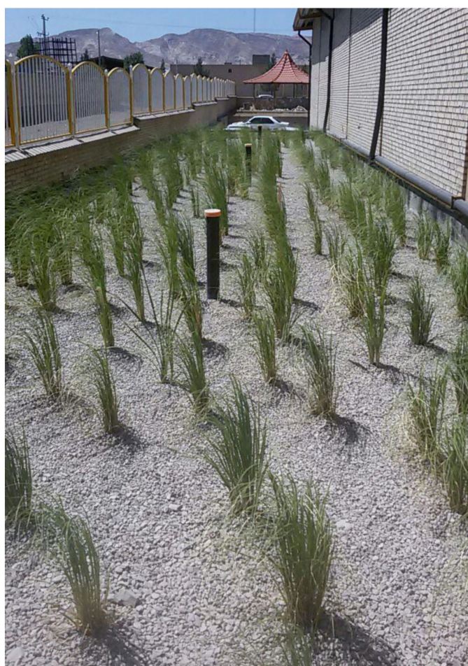
Figure 7. The full-scale system of settling tank and a horizontal flow Constructed Wetland at a glass manufacturing industry in Iran for wastewater treatment and reuse (picture taken just after plants' establishment).

This project represents the first time where wetland technology was applied for the glass manufacturing industry, hence, it consisted of two phases: first an experimental unit was built, monitored and optimized, and then, the full-scale CW system was built based on the outcome of the experimental phase. The tested design consists of a sedimentation tank with two settling compartments and an integrated upflow filtration layer made of local natural cobbles to retain suspended solids and to promote natural flocculation of insoluble silica particles ( \text{SiO}_2 ), followed by a HFCW. The wetland was planted with the indigenous pampas grass ( Cortaderia selloana (Schult. and Schult. F.) Asch and Graebn.). The pilot system operated for three months. Once the operational parameters (e.g., hydraulic retention time, hydraulic loading rate, pollutants removal) were optimized, the full-scale wetland was constructed, treating 10 m 3 /day of the industrial effluent (Figure 7).