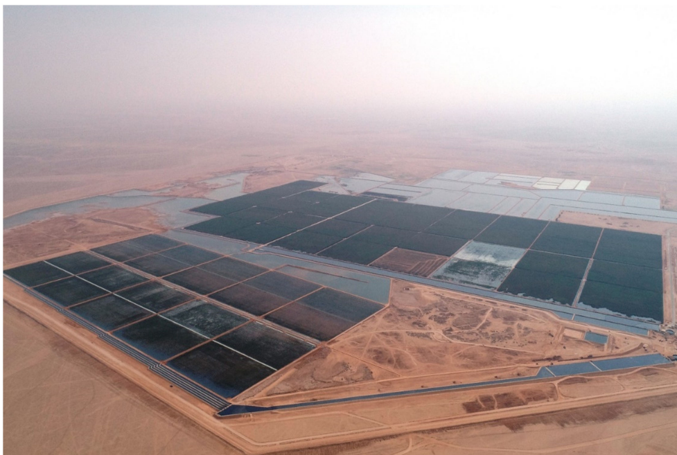
Figure 10. Aerial view of the Constructed Wetlands and evaporation ponds for oily produced water treatment in Oman (Courtesy: Bauer Nimr LLC).

into the FWS wetlands via a long buffer channel, and the wetland-treated water flows downstream into the EPs [18].