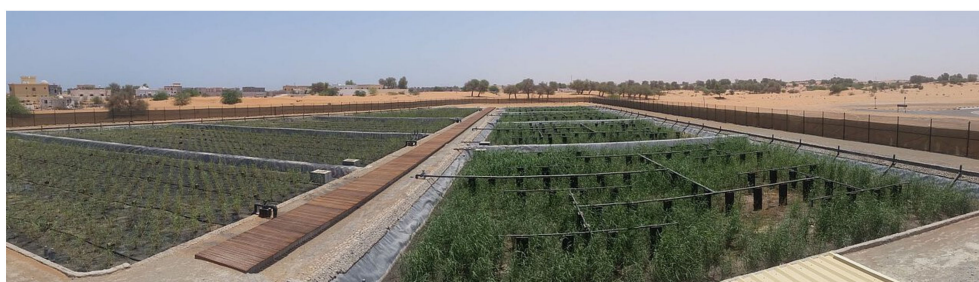
Figure 4. Aerial view of the French Constructed Wetland with two stages VF beds in Al Hamra, Ras Al Khaimah, UAE ([54]).

Only a few other successful projects using the French VFCW design have been constructed in the region. Another example facility (Ingenieurbüro Blumberg, Bovenden, Germany) exists in Al Hamra, Ras Al Khaimah, UAE (Figure 4), serving a residential area of 100 villas with 800 PE, equivalent to an inflow of 216 \text{ m}^3/\text{day} [54]. The four first stage VF wetlands cover an area of 2700 \text{ m}^2 and the four second stage VF wetlands an area of 3600 \text{ m}^2 . The inflow quality (COD of 446 \text{ mg/L} , \text{BOD}_5 of 175 \text{ mg/L} , \text{NH}_4\text{-N} of 33 \text{ mg/L} , TP of 12 \text{ mg/L} , TSS of 308 \text{ mg/L} ) is typical for this type of wastewater source, while the treated effluent (COD of 22 \text{ mg/L} , \text{BOD}_5 of 7 \text{ mg/L} , \text{NH}_4\text{-N} of 1 \text{ mg/L} , TP of 0.4 \text{ mg/L} , TSS of 5 \text{ mg/L} ) is reused onsite for irrigation of green areas [54].