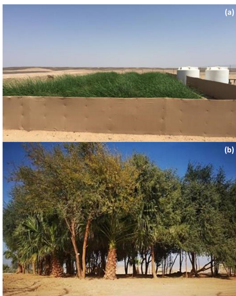
Figure 2. (a) A French Constructed Wetland in the desert of Oman consisting of two stages with VF beds and (b) the irrigation field for treated effluent reuse ([52]).

Such a CW facility has been designed and constructed in Oman (Bauer Nimr LLC, Muscat) for the treatment of wastewater from workers' camps of oil production facilities in a desert environment (Figure 2; [51,52]). Most of the wastewater volume is transported to the wetland facility via vacuum tanker trucks and offloaded directly into discharge pits. This wetland system is designed to treat 120 m 3 /d generated by 600 PE [51]. The first stage of three parallel VFCW beds operates with an alternating cycle, i.e., two days of feeding followed by six days of resting, while the second stage has two parallel VFCW beds. The net treatment area of the CW beds is 1340 m 2 (Figure 2a). All beds are filled with gravel and planted with native plant species (i.e., Phragmites australis (Cav.) Trin. ex Steud., Typha domingensis Pers. and Schoenoplectus litoralis (Schrad.) Palla) [51,52]. It is important to note that this area faces every year sand storms that result in the dust/sand deposition on the surface of the gravel layer. One practical and easy way to control this phenomenon is the installation of a textile fence (Figure 2a).