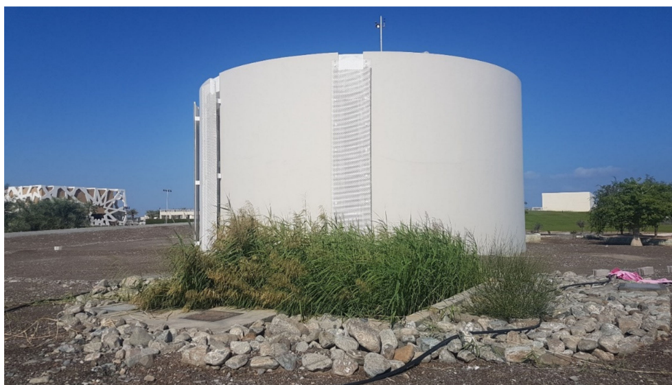
Figure 6. The demonstration unit for onsite wastewater management consisting of a septic tank and a horizontal flow Constructed Wetland at the EcoHaus project of the German University of Technology in Oman.

A research and demonstration project was developed by the German University of Technology in Oman (GUtech) and the Research Council of the Sultanate of Oman in 2011 [69]; the EcoHaus project planned and built a net-zero-energy residential building on the GUtech campus [70]. The main goal was to identify locally adequate ways of building energy-efficient and sustainable buildings. The EcoHaus is a two-story house of approximately 250 m 2 surface, serving as the university's guesthouse. As part of this ecological approach, an onsite CW system was integrated in the project (Figure 6). The CW was designed to receive all sewerage (black and grey) water from the house and to provide a cost-effective and sustainable treatment so that the treated effluent could be reused for irrigating a garden or a green roof.