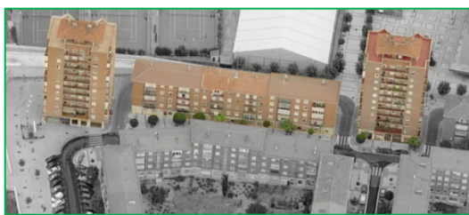
Figure 2. View of the Cuatro de Marzo .

Currently TRL6 (platform prototype demonstration in relevant environment) has been demonstrated for 3 already existing/performed district retrofitting plans: Cuatro de Marzo district in Valladolid (Spain), Mogel district in Eibar (Spain) and Polhem district in Lund (Sweden). The purpose of this TRL is to demonstrate the platform prototype on real districts. In this case is of particular importance to validate that the platform fulfils its technical requirements (correct calculations, relevant calculation time, useful Graphical User Interfaces, etc.) and answers end-user needs (provide relevant and useful information in a time efficient process). All this information obtained from the platform is later compared with the existing and available information of the real retrofitting plans in order to fine-tune the OptEEmAL prototype.