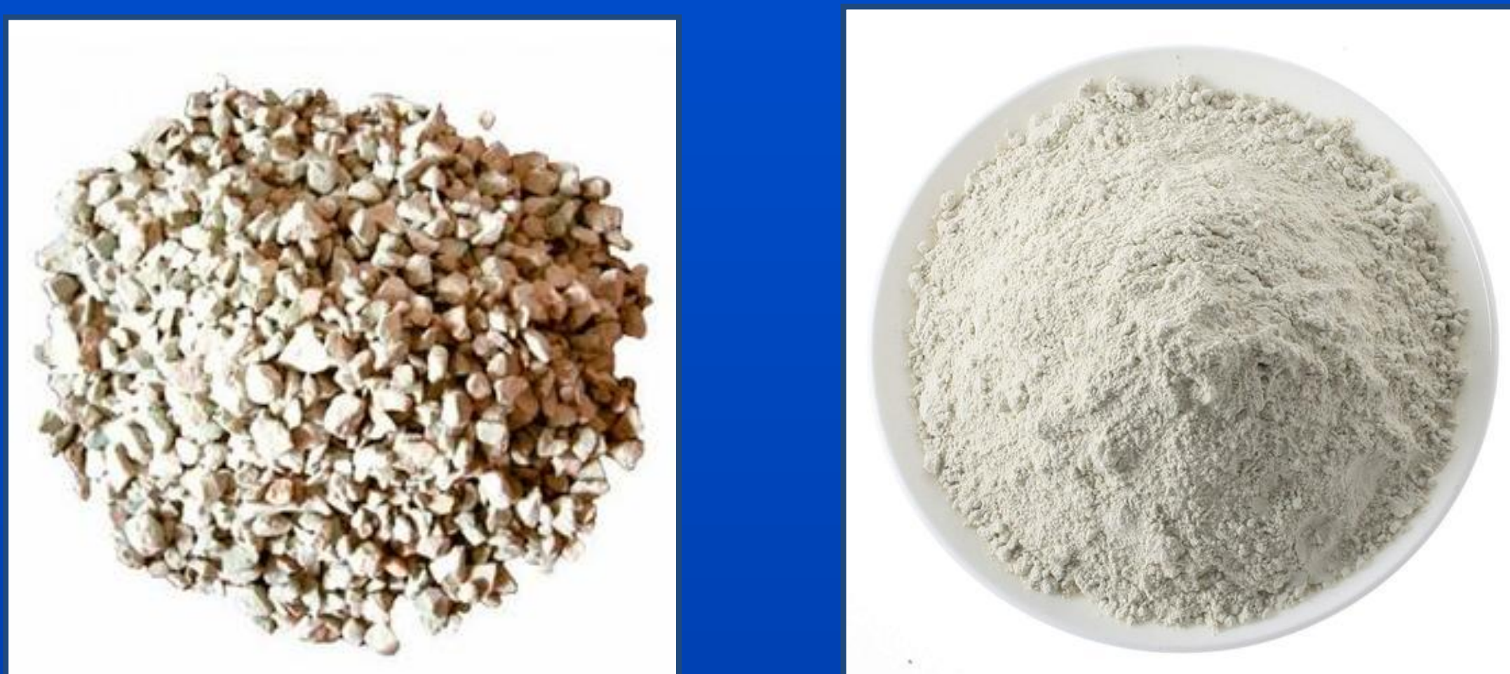
Figure 1. Raw clinoptilolite (left), pulverized clinoptilolite (right).

The zeolite used in the research is clinoptilolite, one of the most suitable natural zeolites for ammoniacal nitrogen removal. Before the beginning of the main experimental procedure, the natural zeolite was crushed and sieved. The fraction retained had effective diameter between 355-600 µm.