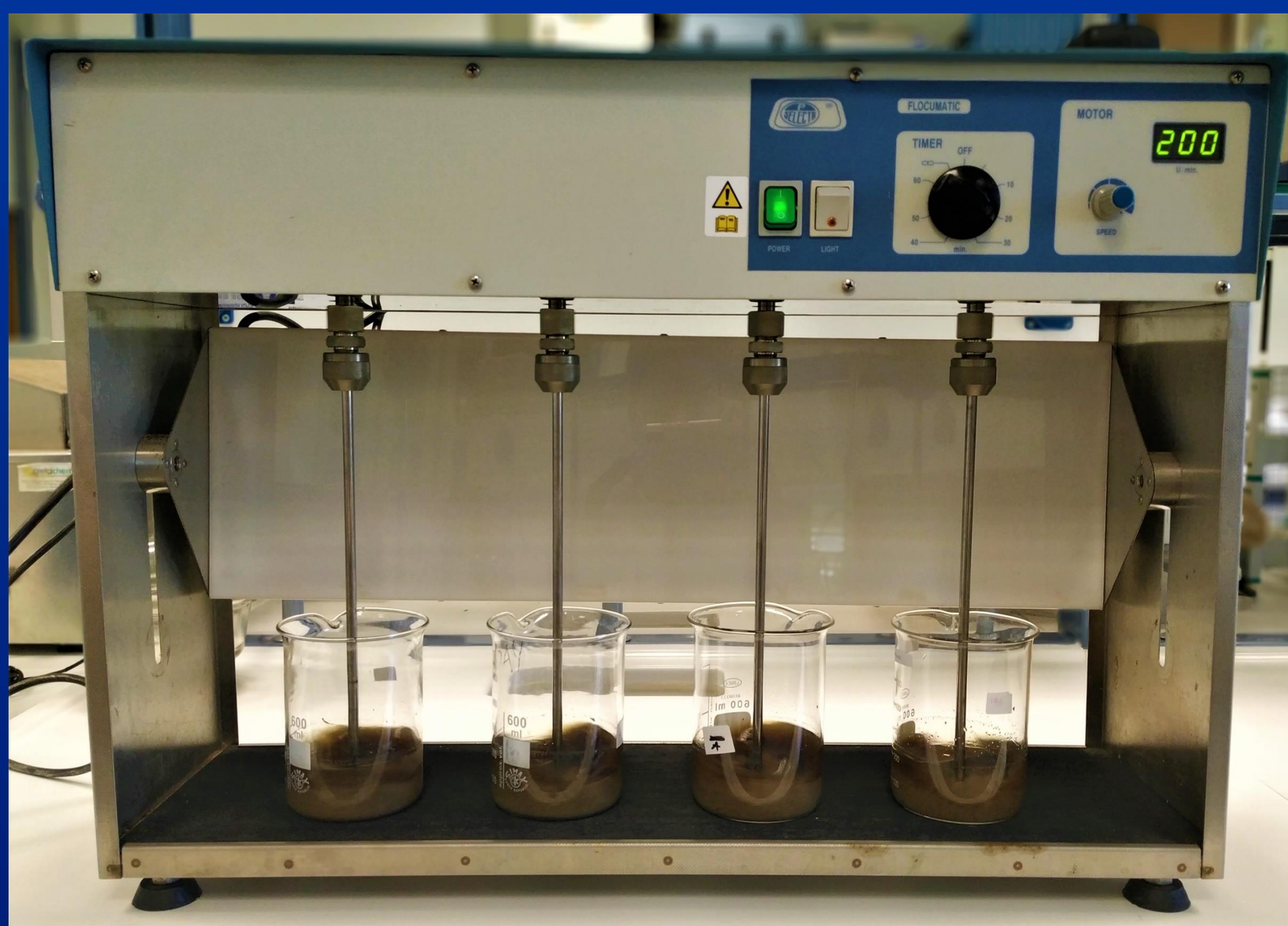
Figure 2. Landfill leachate and activated zeolite are rotated in a multiple position agitator, at 200 rpm, during the adsorption trials.

After the pre-treatment, zeolite was chemically and thermally activated. In detail, chemical activation was carried out by treating the zeolite with aqueous solution of commercial grade sea salt (22.4 % w/v), for 2 h, at room temperature. Then, the chemically activated clinoptilolite, was washed with distilled water, dried and calcinated in a furnace at 500 °C for 2.5 h.